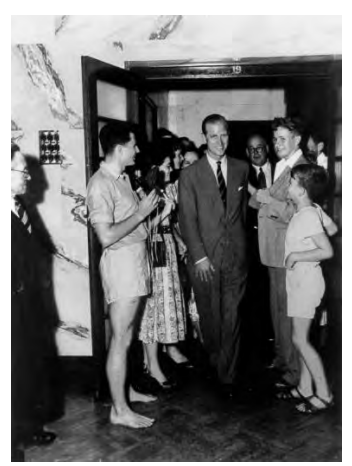
Prince Philip in Brisbane, 1954

The life membership was a way of formally recognising Prince Philip's visit to Brisbane, if not to the Club. The committee meeting following the Royal Visit read letters of thanks from members of the Royal Tour party who had been given honorary membership while in Brisbane.