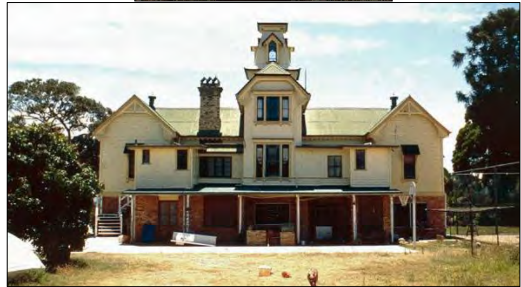
Drew House 1998