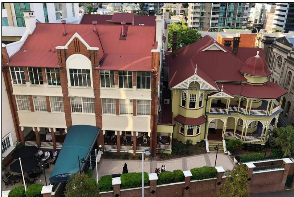
Nov 2017. The extension and connection works of mid 1990s are clearly visible.