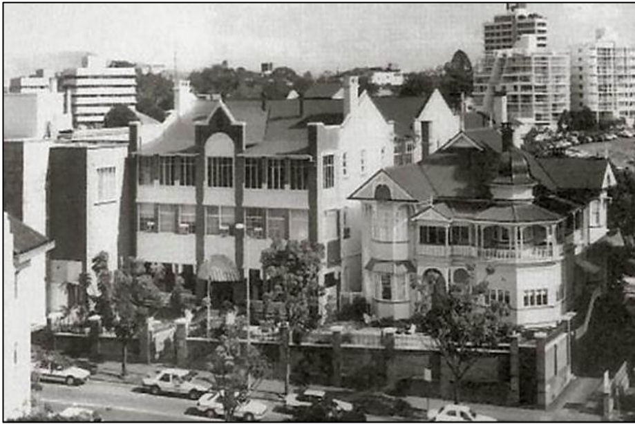
c1985: Note the enclosed verandas of the Green House, the gap between the front of the buildings where the Military Bar was built in the mid 1990s and that, the veranda has not been extended (that was part of those works), the positioning of the flagpoles, the 'top bar in Montpelier' and the first entry awning.