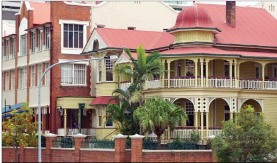
c2016: Shortly after the Green House had been repainted for the first time in about 20 years. The re-opened verandas of the Green House and the Montpelier veranda extension outside the Military Bar are clearly visible.